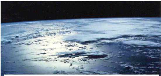
“Renewable solutions for a finite planet since 1973”